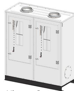
Xbag - 2