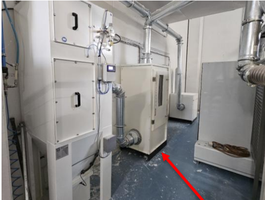
Xbag - 1 Prefilter

Xbag Prefilter to collect bigger size particles during non-contact surface cleaning