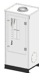
Xbag - 1