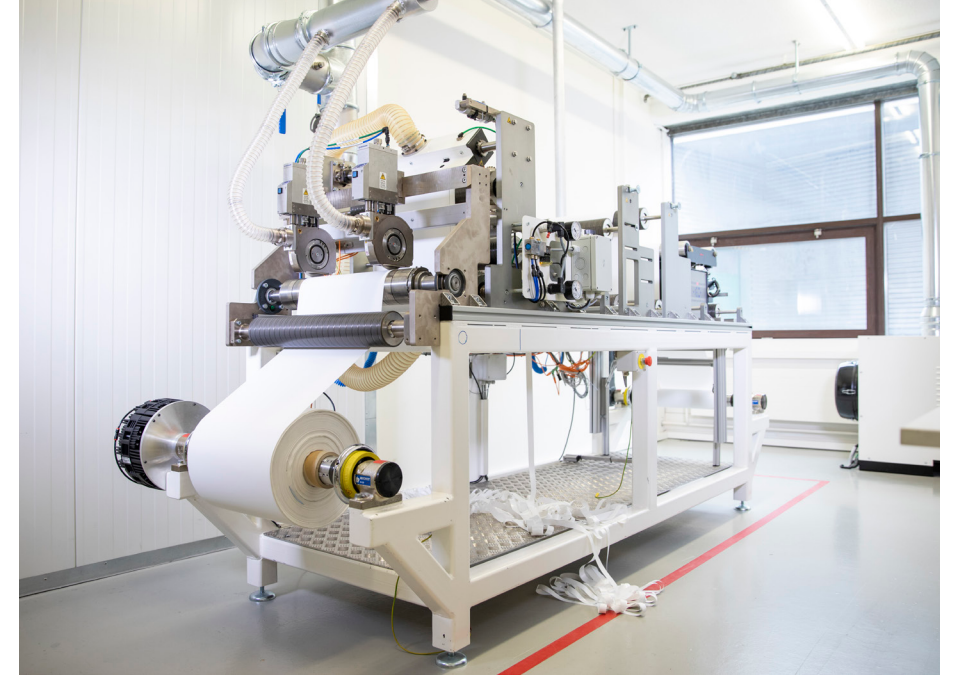
The laboratory facility at Gema with the SLITstream slitting dust extraction system