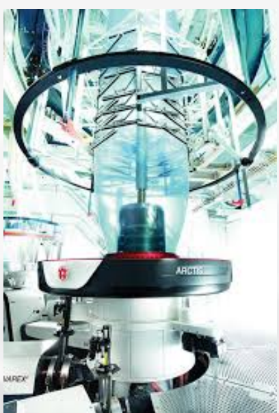
W&H Blown Film Machine

2x Xstream dust removal module with iONstream FUSION, 6kV electrostatic neutralising bars working width 2200mm