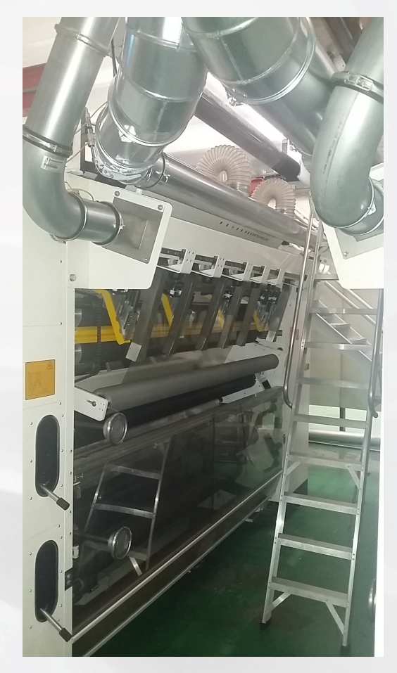
Blown film for food packaging