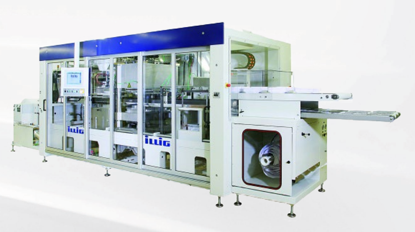
ILLIG RV53d Thermoforming Machine