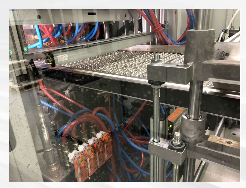
2x iONstream FUSION, 12kV, 860mm Electrostatic discharging bars